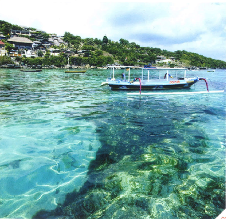
03_leaving lembongan, looking back at batu karang resort

Scoot, Jl. Hangtuah 27, Sanur Kaja T: 0361 285522, www.scootcruise.com