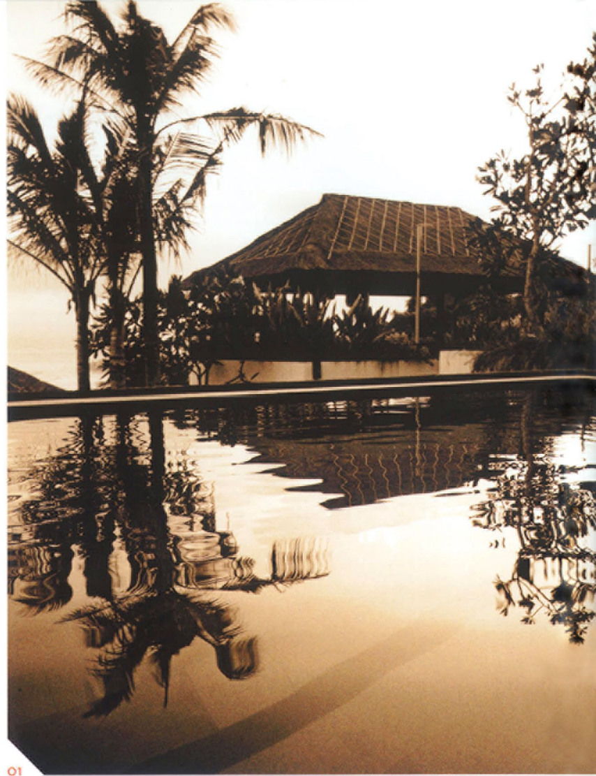
02_overlooking the coast of lembongan island