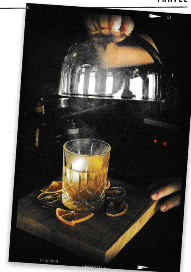
Must try: The Lossie Haze is crafted from the waters of the River Lossie in north-east Scotland. The Speysid whisky adds a smoothness to this hazy, smoked and wood-planked infused cocktail.

I could grow to like it, but the prices were a shock and the relaxed atmosphere of The Howff was just too recent for me not to miss it all.