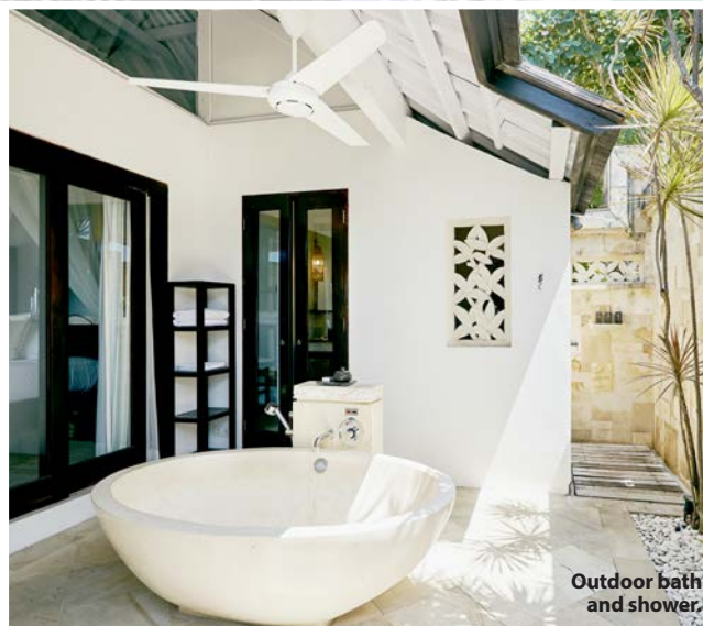
Outdoor bath and shower.

That evening, we enjoy dinner at the Deck