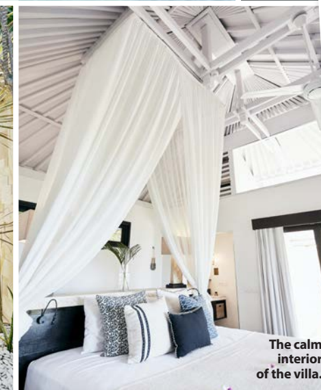
The calm interior of the villa.