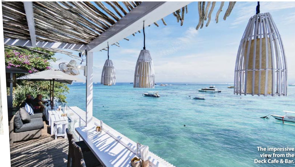
The impressive view from the Deck Cafe & Bar.