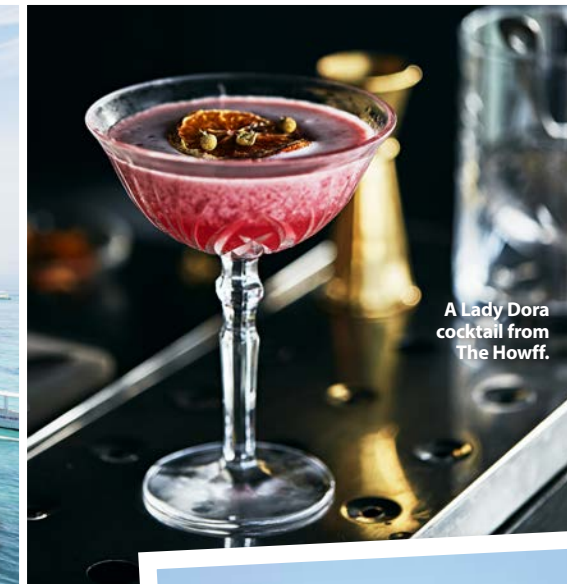
A Lady Dora cocktail from The Howff.